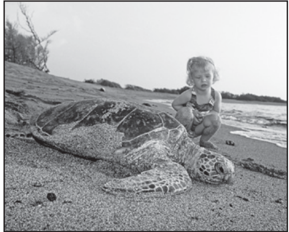
The leatherback is the biggest of all the sea turtles.

But the leatherback's shell is different. Its shell is made up of cartilage and tiny bones, but covering these is a layer of leathery skin.